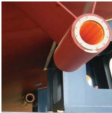
Thordon COMPAC Starboard Strut Bearing Installed on Mega Yacht, Athena (right)